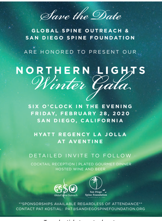
To order tickets, or to donate visit: https://gsosdsf2020.givesmart.com/