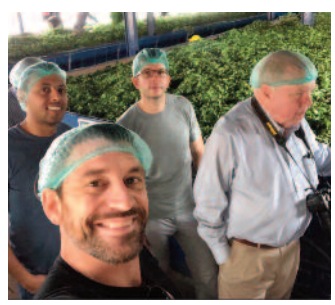
SRS Traveling Fellows at Ganga Hospital in Coimabatore, India